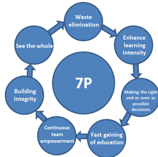
Figure 3. Phases of 7P Lean concept in the education of Industrial Engineers

the above Lean principles. The implementation of this concept eliminates the shortcomings and achieves the division of the task into smaller units, which gives much better results and raises the quality of education.